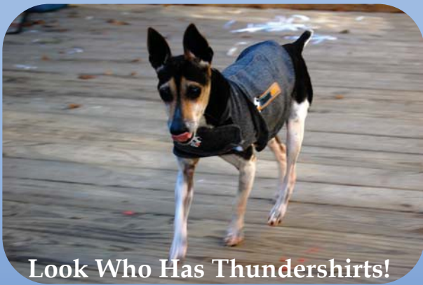
Look Who Has Thundershirts!