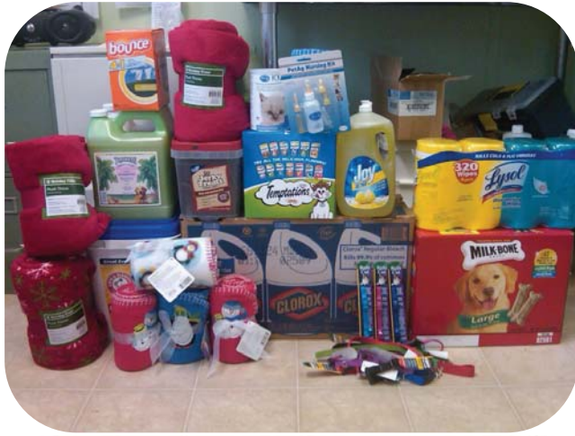
One of many gifts from "Santa PAWS" helpers!

Santa PAWS has been hard at work for the homeless companion animals at the Hertford County Animal Shelter. This is but one set of gifts given to PAWS animals in response to the annual Christmas Wish List. Our donors are numerous, and for concern of leaving someone out, we won't give names. The true